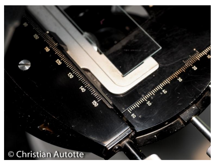
Graduated Locator Markings on one of may microscopes.

here is on a slide that contains dozens of them. But most of the others are not as interesting. So if I want to see those two again, I simply prop the slide M9 and go to location 15x109 to find them again. There is no risk of mistaking the X for Y as one goes roughly from 0 to 55 and the other from 60 to 150. With small variations, it will be the same on all mechanical stages.