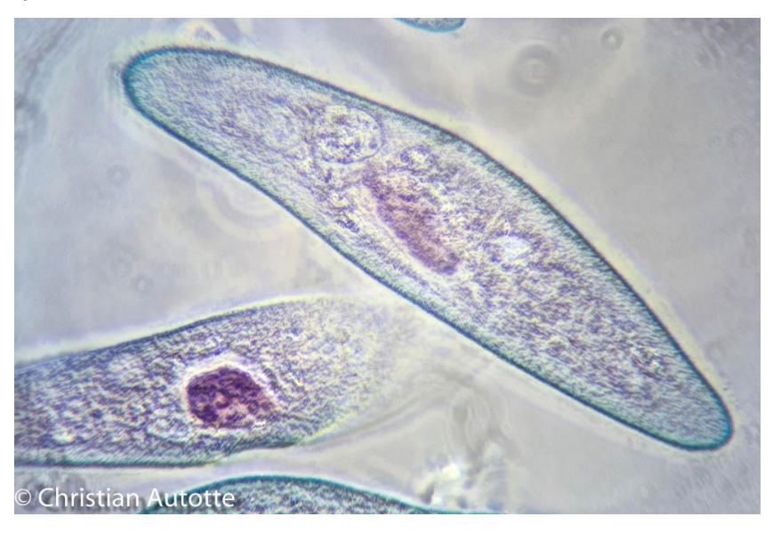
Paramecium, M9 – 15x109, 400x, Phase Contrast.