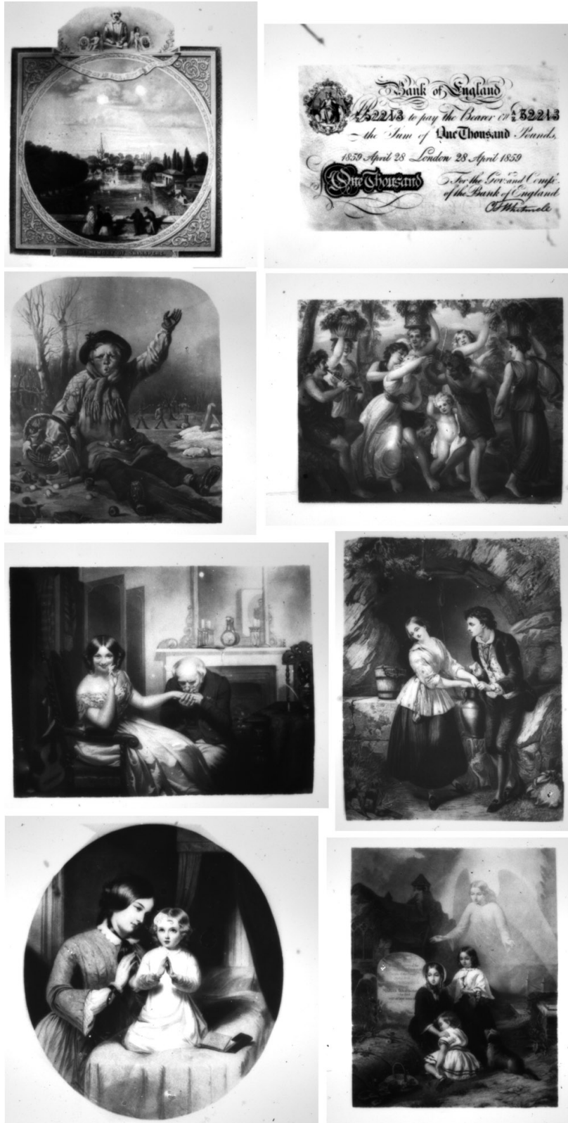
Figure 4. Images from slides by J.C. Stovin. Many of the images are exceedingly fine grained, and details are clear at moderately high magnifications.

Top row: "To the memory of Shakespeare, Stratford upon Avon" and "£1000 Bank of England Note" (an item which almost all of Stovin's customers could only dream of holding. The note is dated 28 April, 1859, serial number 32213).