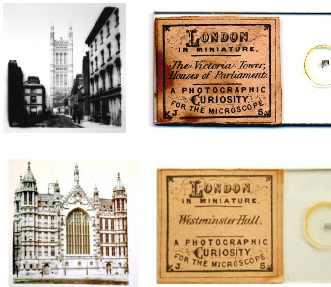
Figure 2. Two microphotographs with titles that match descriptions of full-sized photographs displayed by Stovin at the 1862 London Exposition. According to Nicol (1881), Stovin expanded this series to 36 different views.

At the 1862 London Exhibition, Stovin displayed both a group of microphotographs and a set of eleven full-sized photographs of London's "principal buildings". The published descriptions of those large photographs coincide with several JS slides labeled "London in miniature", and it is likely they were from the same negatives. Examples are illustrated in Figure 2.