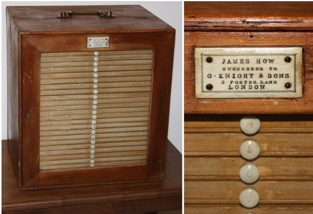
Figure 10. A large microscope slide cabinet sold by James How, successor to George Knight. Produced between 1862 and 1872. No microscope slides have been identified that can be attributed to the periods when James How or George Knight operated the optical shop at 2