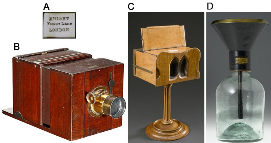
Figure 2. Optical and scientific instruments produced by George Knight and Sons. (A)

The 1846 Post Office Directory for London recorded George Knight and Sons as “ scientific instrument makers ” at 2 Foster Lane, and “ ironmongers ” at 41 Foster Lane. Examples of instruments and supplies produced by Knight (and Sons) are illustrated in Figures 2 and 3. A Culpepper-style microscope attributed to Knight is described, but not illustrated, at http://www.christies.com/lotFinder/lot_details.aspx?intObjectID=946660 .