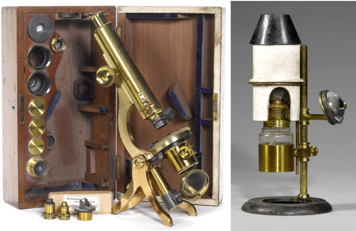
Figure 9. A microscope and a microscope lamp produced by James How. In that they bear his name, they date between 1862 and 1872. The same model of lamp was sold by How's successor, James How and Co., until at least the end of the 1880s.

business (or not yet changed the sign on his shop).