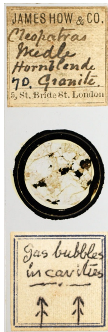
Figure 14. A How and Co. microscope slide, sold from their location at 5 St. Bride Street.

Like his predecessors, Smith displayed his microscopes, magic lantern slides and other products at meetings. These were often among the displays of commercial suppliers, enhancing their function as advertisements to his fellow society members and visitors. For example, the report of the 1877 Annual Conversazione of the Quekett Microscopical Club read, “By permission of the Council of University College, a Conversazione was held in the Museum, and the East and South Libraries, on Friday, the 13th of April. About 1,050 ladies and gentlemen were present. 120 microscopes were brought by the members of the Club, and 60 by members of the South London, the Croydon, the Sydenham, the Greenwich, and the New Cross Societies. The leading London Opticians also kindly lent their assistance, as on former occasions...Among the large number of excellent professional exhibits, the following were particularly noticed: Messrs. Jas. How and Co. (by Mr. G.J. Smith). - Popular Binocular and Students' Microscopes. Sections of Rocks - Igneous, Sedimentary and Metamorphic, &c.” and “Mr. G. J. Smith (James How & Co.) exhibited at intervals, during the evening, by means of the oxy-hydrogen apparatus, in one of the dark rooms, Views of Scottish Scenery, Statuary, Photomicrography, Experiments with Polarized Light, &c.”