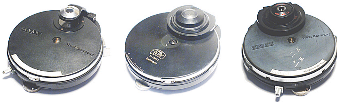
Fig. 1. Three models of Zeiss Circular/Rotary Phase Contrast Condensers.

Phase Contrast Condenser 0.9 NA with swing out lens, II Z