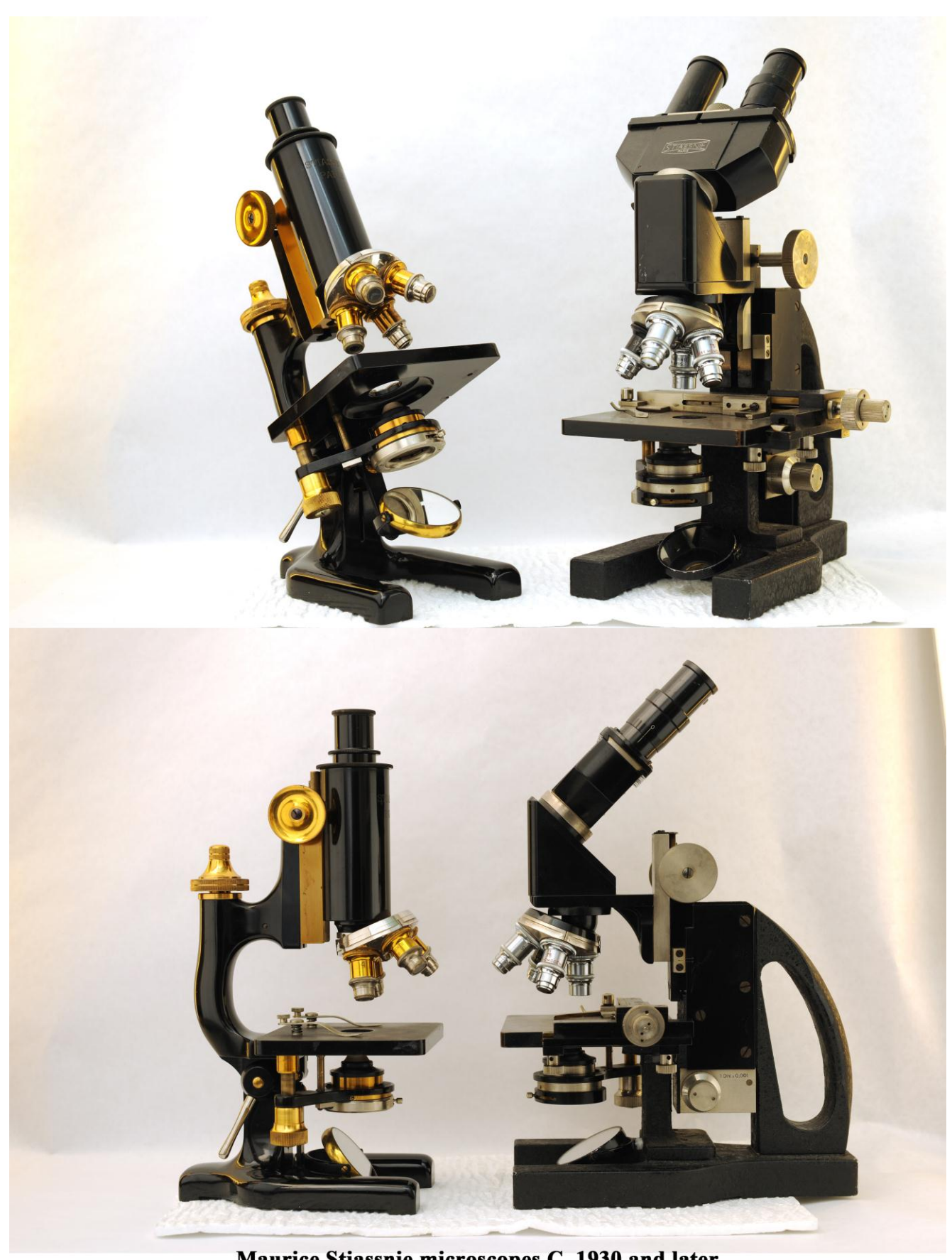
Maurice Stiassnie microscopes C. 1930 and later