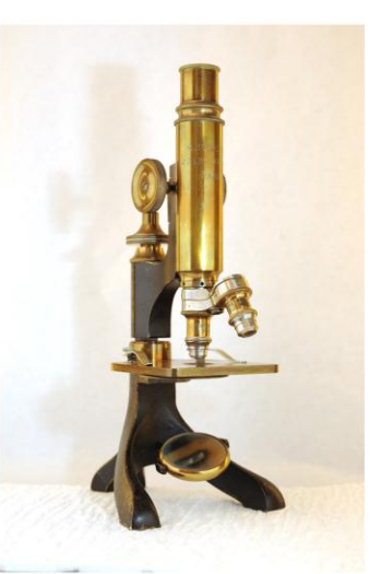
Stiassnie-Verick Earlier Models C.1900