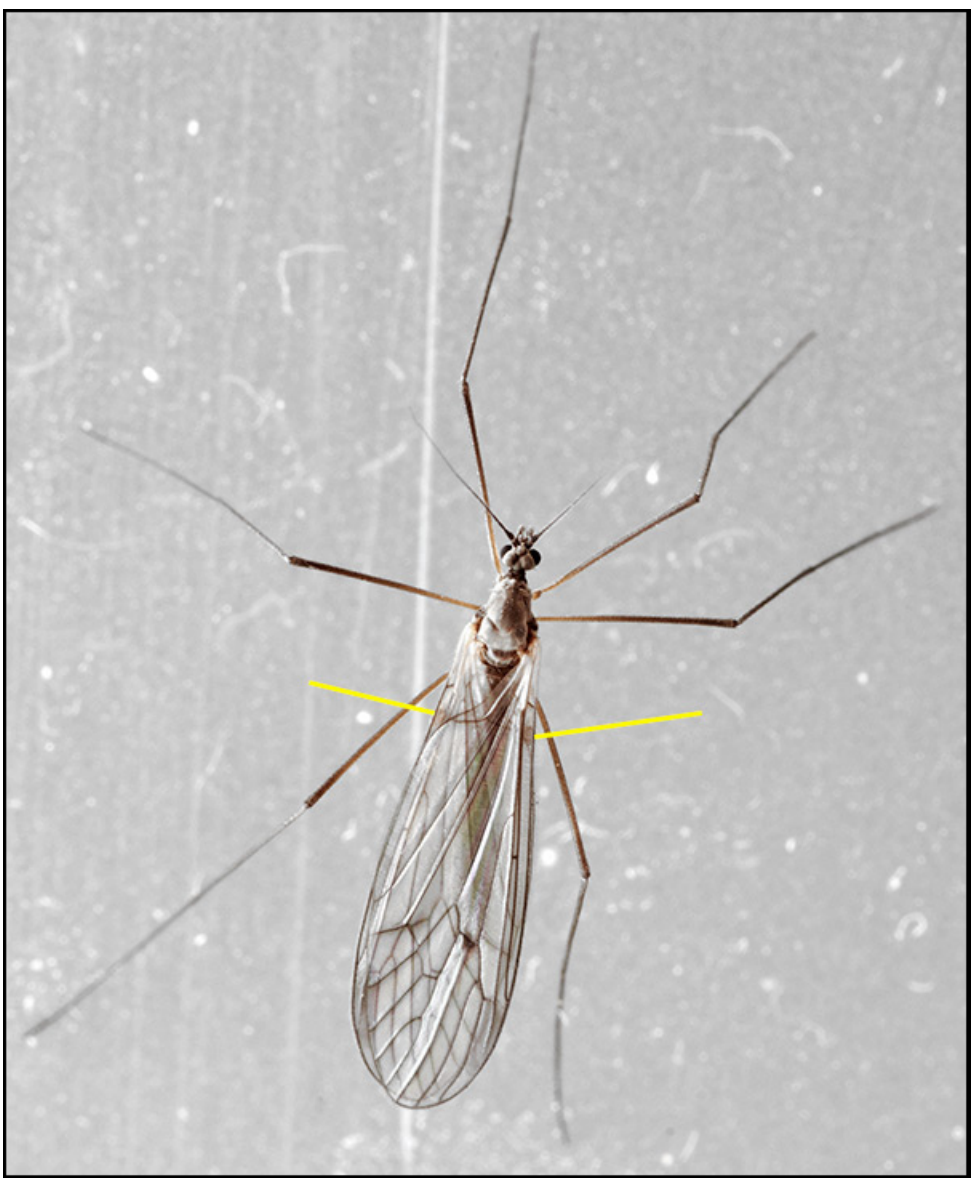
Fig. 1. Dorsal view of a Winter Cranefly, halteres just visible below forewings.

Figure 1 is an image of a live Winter Cranefly , Trichocera sp., showing the large forewings and the just-visible knobs of the halteres.