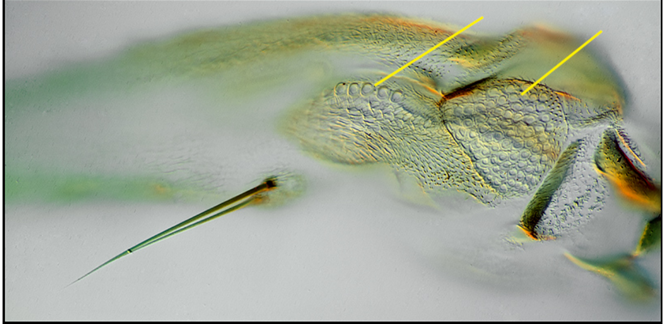
Fig. 6. Base of haltere, selective-focus on the dorsal sensilla plates.

Figure 6 is a selective-focus of the dorsal surface (as seen on the slide) of the haltere base emphasizing the upper sensilla plates.