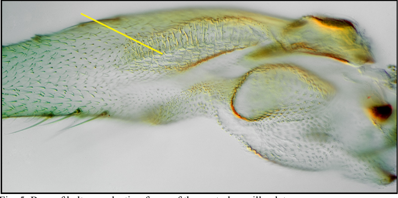
Fig. 5. Base of haltere, selective-focus of the ventral sensilla plate.

Figure 5 is a selective-focus of the ventral surface (as seen on the slide) of the haltere base emphasizing the lower sensilla plate.