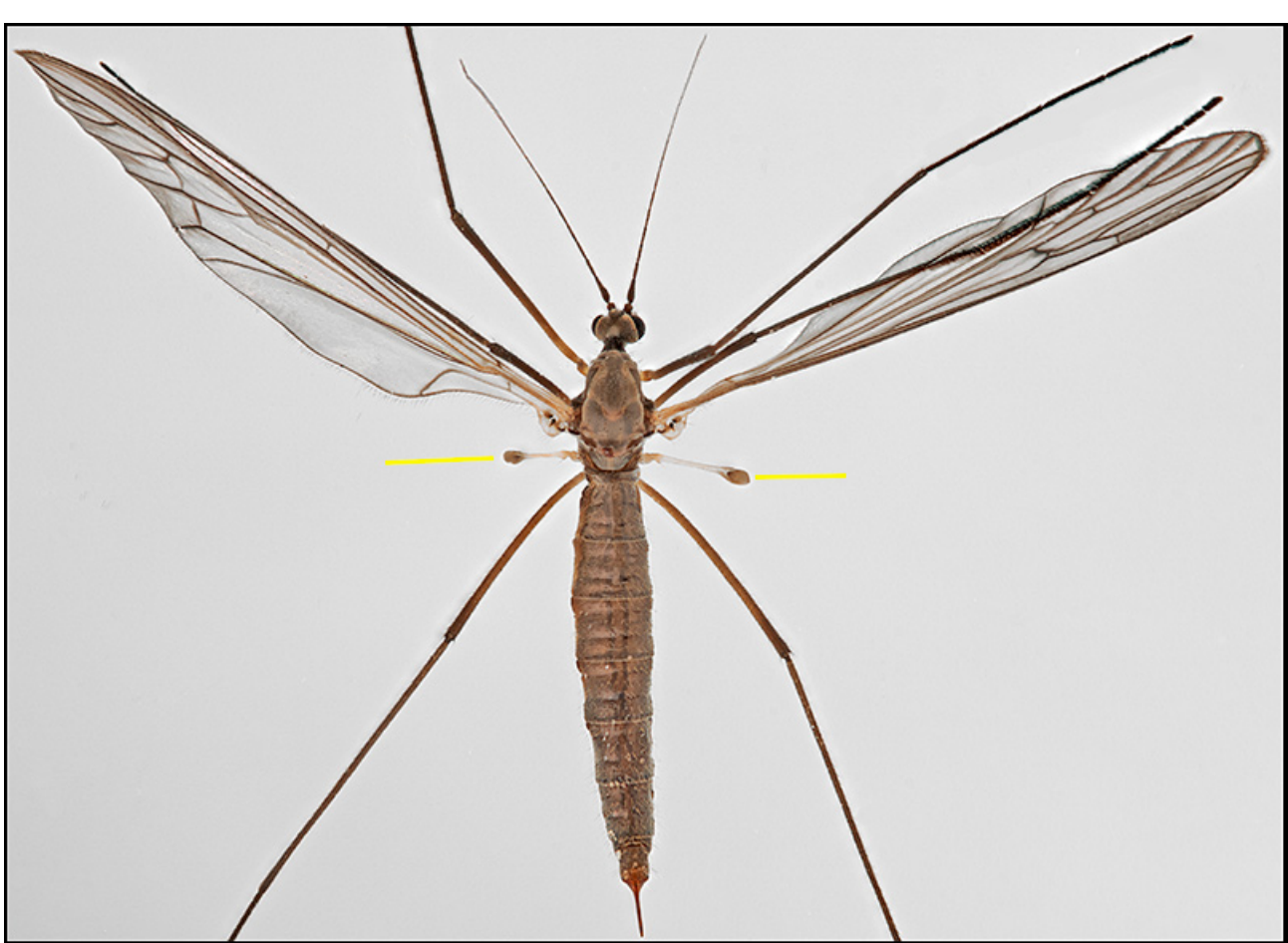
Fig. 2. Dorsal view of a Winter Cranefly showing the relatively large halteres.