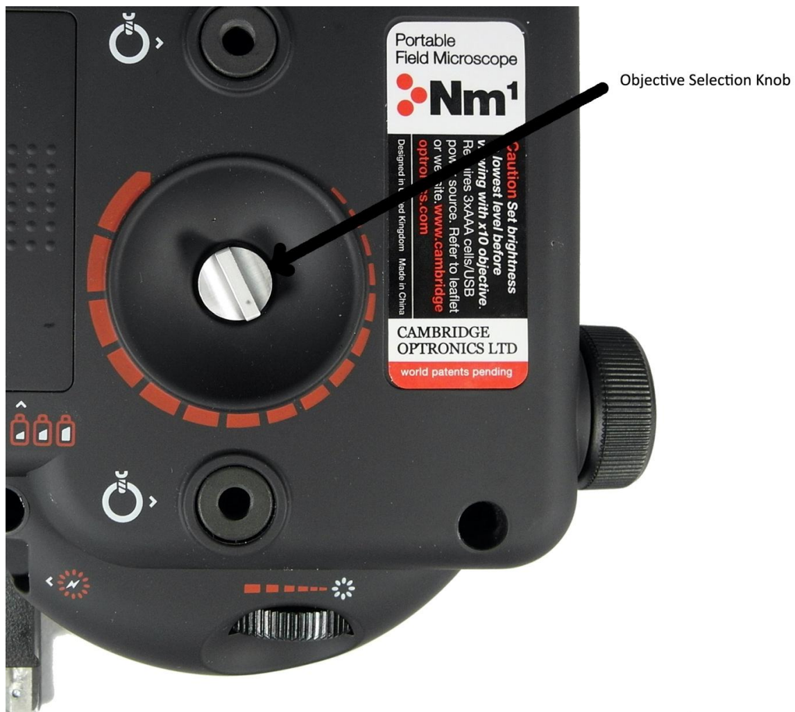
Figure 15. Rotating knob under the microscope, used to select objectives

The objectives are changed by a continually rotating knob, with click stops, on the bottom of the microscope, Fig. 15. This knob is graphically coded to show the direction of increased / decreased magnification.