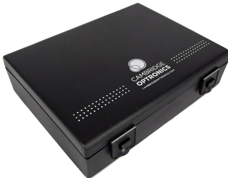
Figure 3. Nm1 mechanical stage ("XY Slide Indexer") case

The mechanical stage, if obtained separately, comes in a plastic case, essentially identical in size to that provided to house the Meade Readiview, Fig. 3, and appears to be made of the same material.