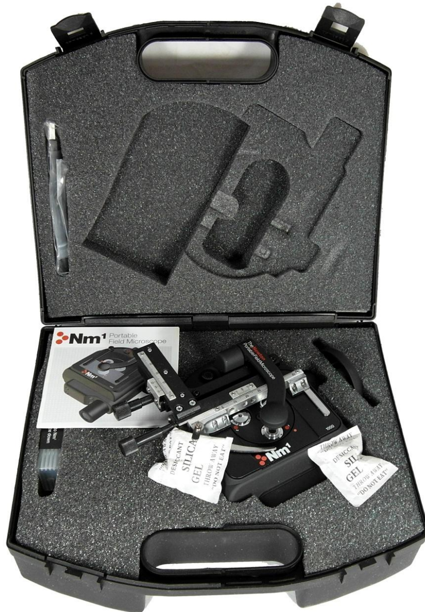
Figure 1. Newton microscope in its foam lined plastic transport case as received