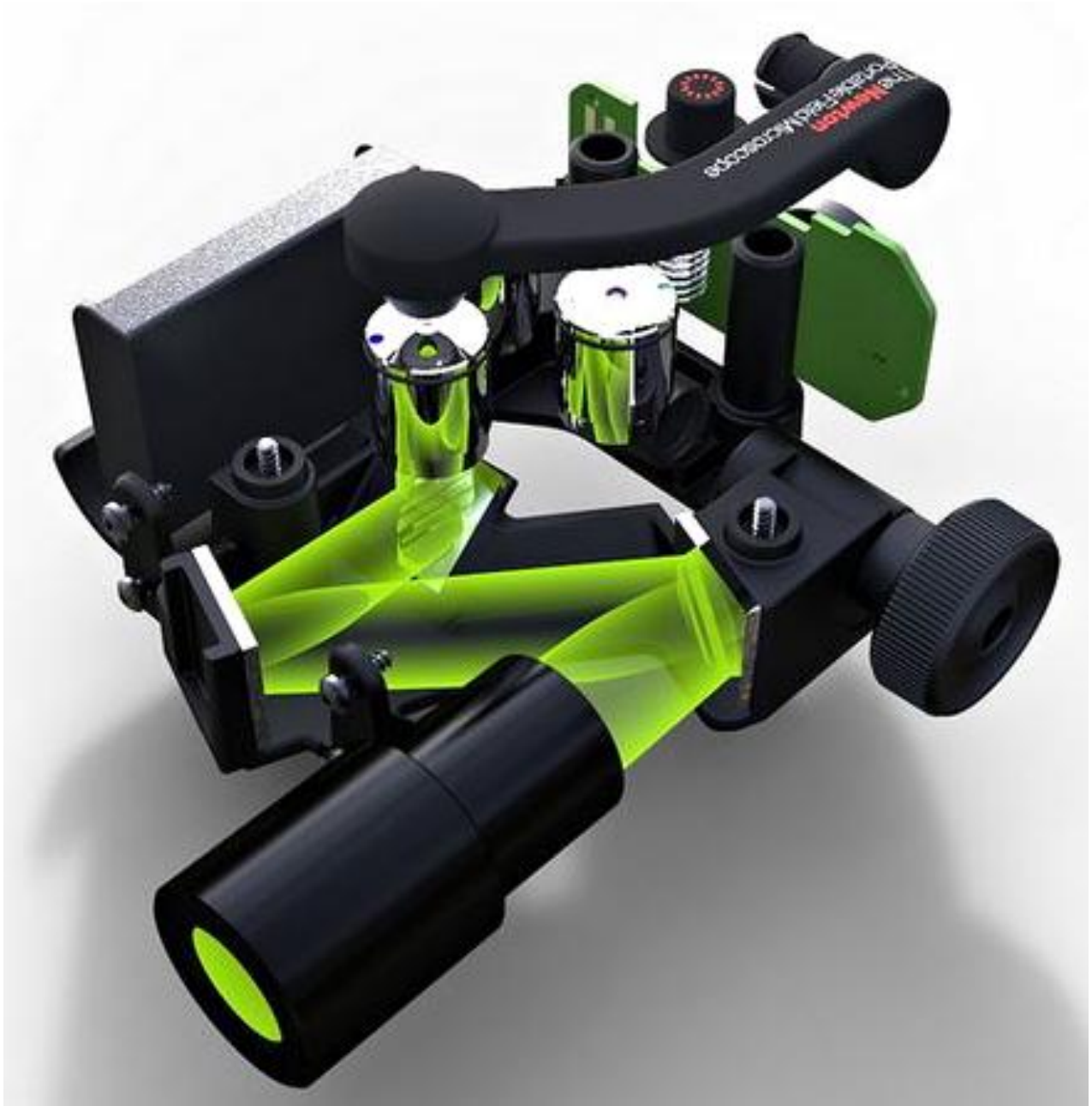
Figure 6. Newton Microscope optical path.