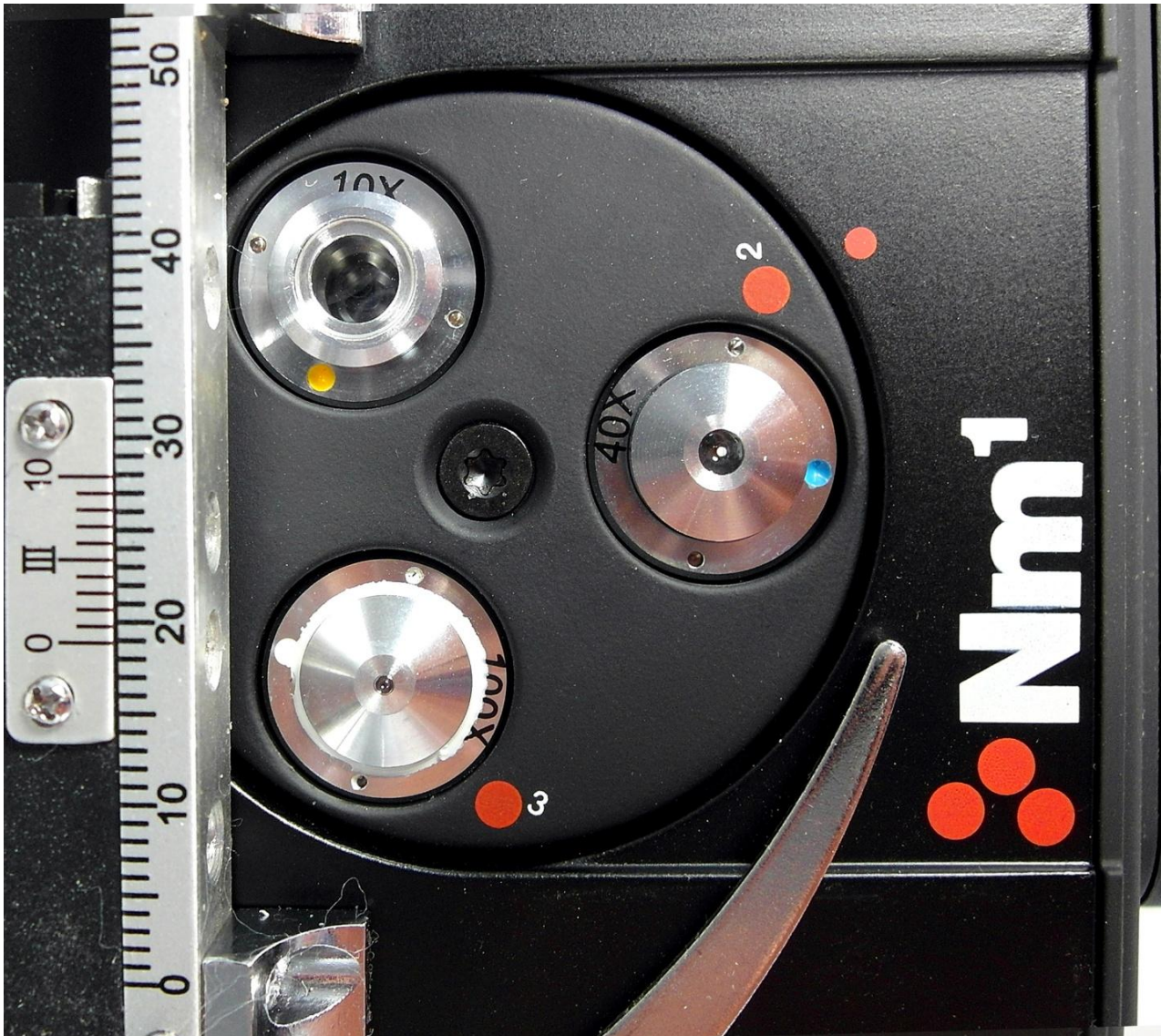
Figure 14. Nm1 -1000 objectives from top of microscope

The small objectives are marked on their top surface, and their positions are marked on the turret. They use standard color codes (these codes essentially use the spectrum starting at black for the lowest magnification and ending with white as the highest, using cobalt blue, rather than violet, to identify 60 and 63x).