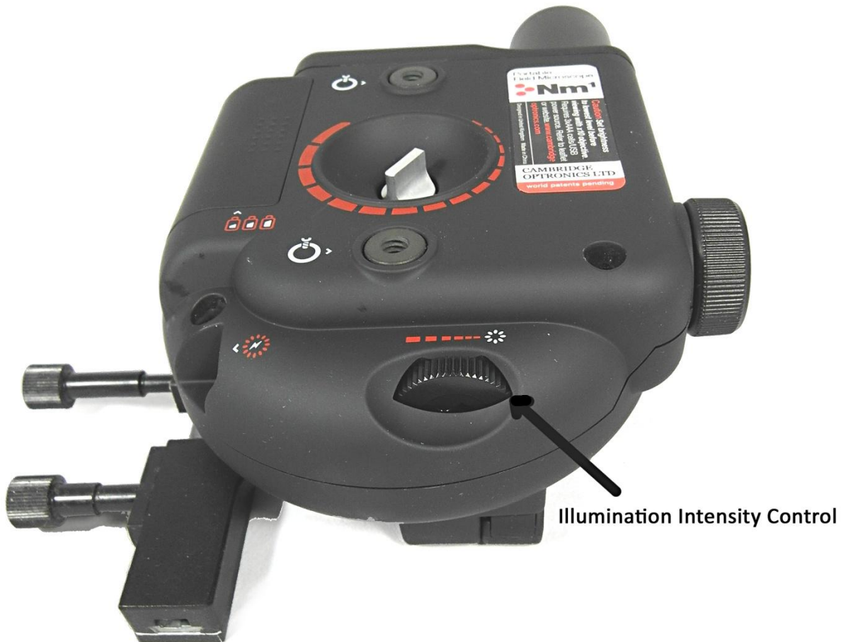
Figure 12. Knurled illumination adjustment knob

The built-in illumination arm (light arm) can be swung away, so that a slide can be lit by external illumination, Fig. 13. I found this most helpful, as the built-in white LED illumination was usually too bright for me at 10x magnification, even at its lowest brightness setting.