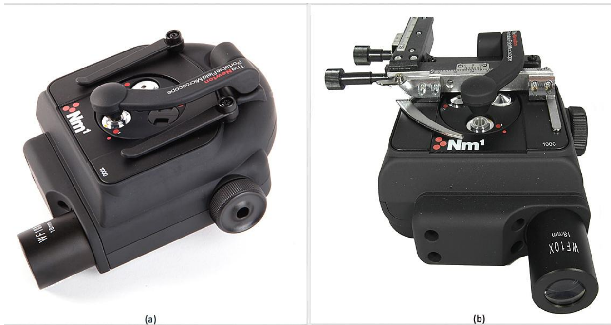
Figure 2. (a) Nm1 - 1000 with stage clips, and (b) the Nm1 - 1000 XY. Figure (a) Courtesy, and with permission, of Rick Dickinson

The mechanical stage, if obtained separately, comes in a plastic case, essentially identical in size to that provided to house the Meade Readiview, Fig. 3, and appears to be made of the same material.