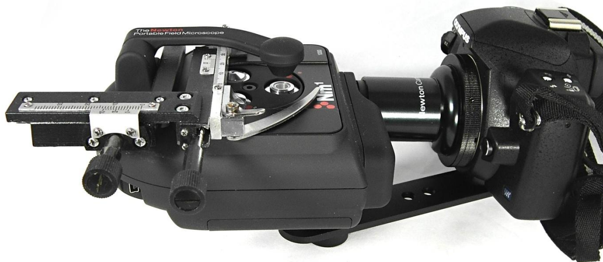
Figure 5. Olympus DSLR mounted to Newton Microscope

Table 1, reproduced and updated from Part 1 of this paper, provides more details about the Nm1s.