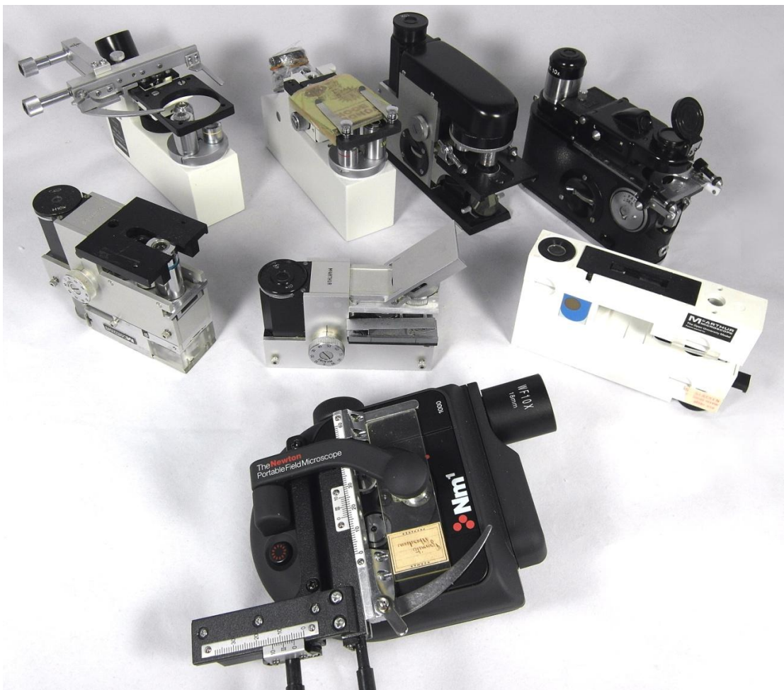
Figure 7. Newton Microscope and other folded-optics instruments. First Row: Nm1 - 1000 XY; Second Row: McArthur, Vickers McArthur, OU McArthur; Third Row: Swift FM-31, New FM-31 Clone, TWX-1, Nikon H

All the Newton Microscopes use a unique compact 3D folded-optics design, see Fig. 6. Their size can be compared to other folded-optics microscopes available for sale on the used market, e.g., the McArthur, Vickers McArthur, the OU McArthur, the Nikon H, and the Swift FM-31. Also, new versions of FM-31 clones are now available for sale, (Kreindler, 2011-1). Comparison pictures, illustrating the relative sizes of the Newton Microscope in comparison to some other folded-optics models can be seen in Fig. 7. There were a variety of manufacturers who made metal McArthur microscopes. The two examples included here are typical. Other Dickinson/Dunning folded-optics microscopes were discussed in Part 1 of this paper. However, these models were not designed, as the Nm1 series was, or the other folded-optics microscopes shown (the OU McArthur being the exception) for serious professional use.