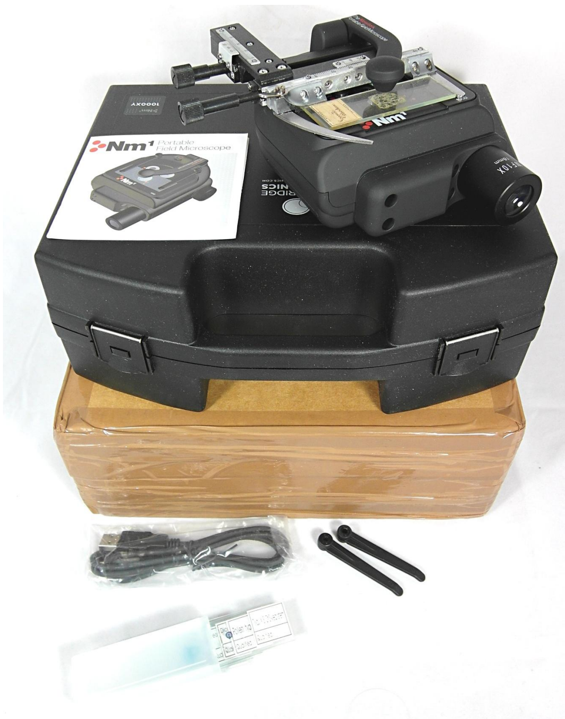
Figure 8. The Newton Microscope, and accessories, outside of its shipping box. Slide on microscope is not included.