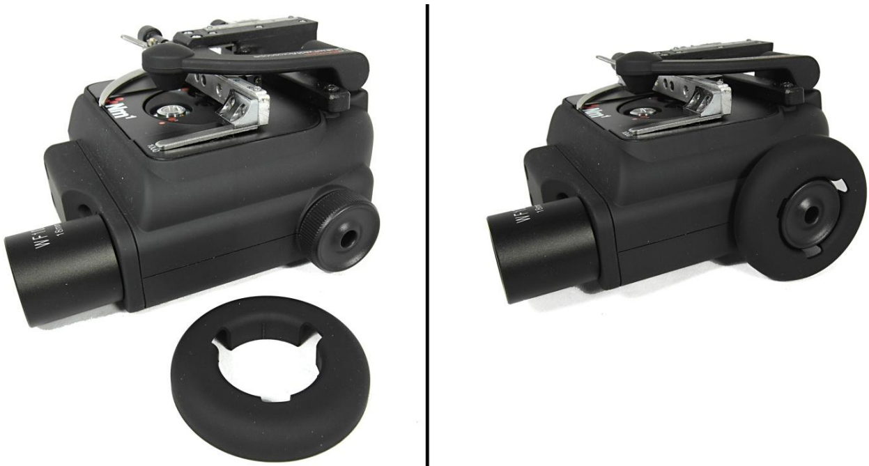
Figure 9. Newton Microscope fine focus adapter dismounted and mounted