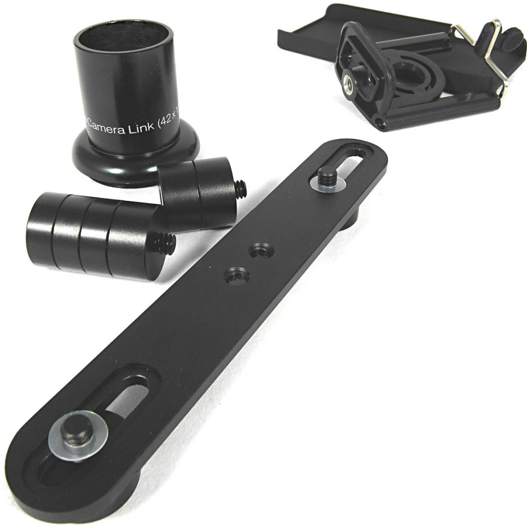
Figure 4. Two Newton Microscope (Nm1) camera adapters