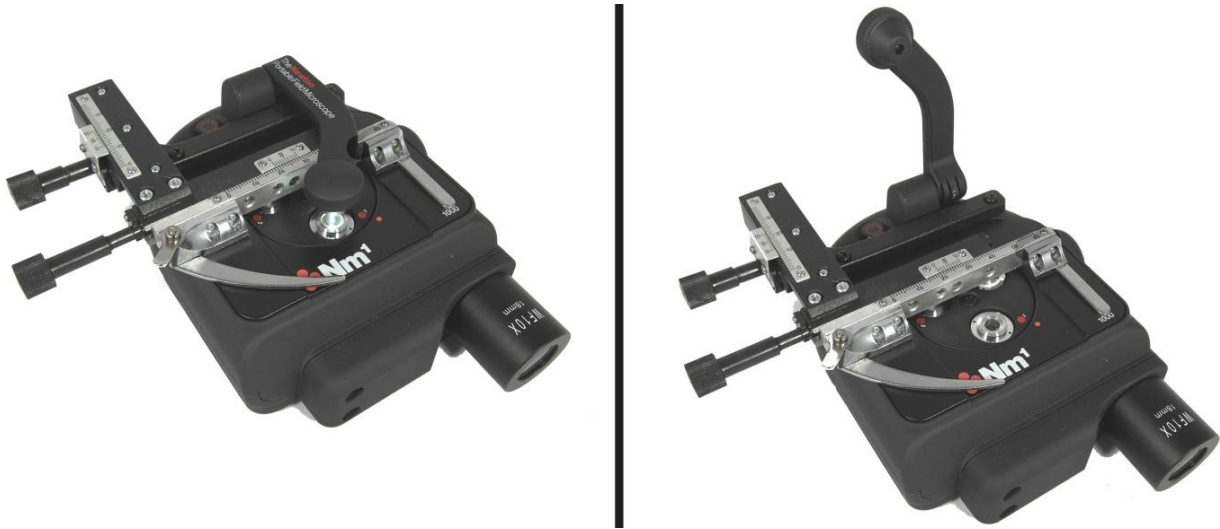
Figure 13. The light arm is lowered for built in illumination, and raised for external illumination