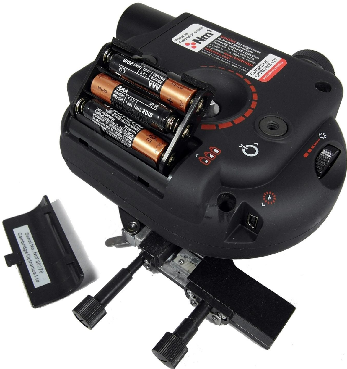
Figure 11. Nm1 battery compartment with its three AAA batteries, underneath the microscope