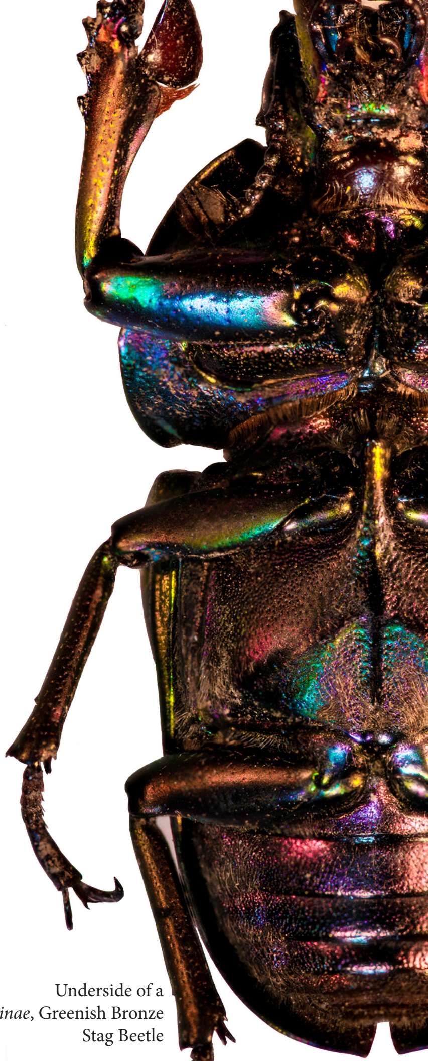
Underside of a Lamprima adolphinae , Greenish Bronze Stag Beetle

Cover Image: New Guinea Coleoptera ischiopsopa, Flower Beetle