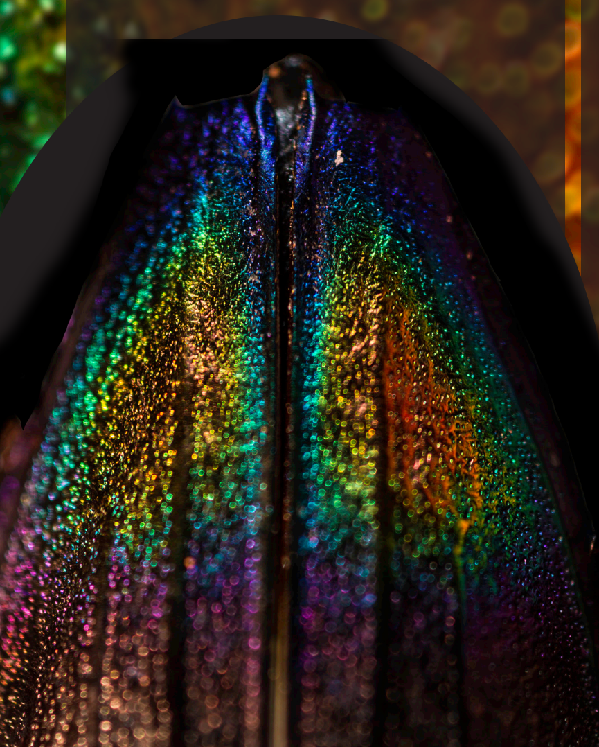
(Left) Chrysochroa toulgoeti , Metallic Wood-boring Beetle

Having a shiny, colorful exterior is a big warning sign to predators. In the animal world, it typically means that you are toxic and not palatable. This is not always the case. Over the years of evolution, non-toxic beetles have adopted the stunning coloration of toxic beetles. Similarly to when animals have "fake eyes" and distracting patterns, the brief flashes caused by the iridescence on some beetles may also cause predators to be startled and deterred.