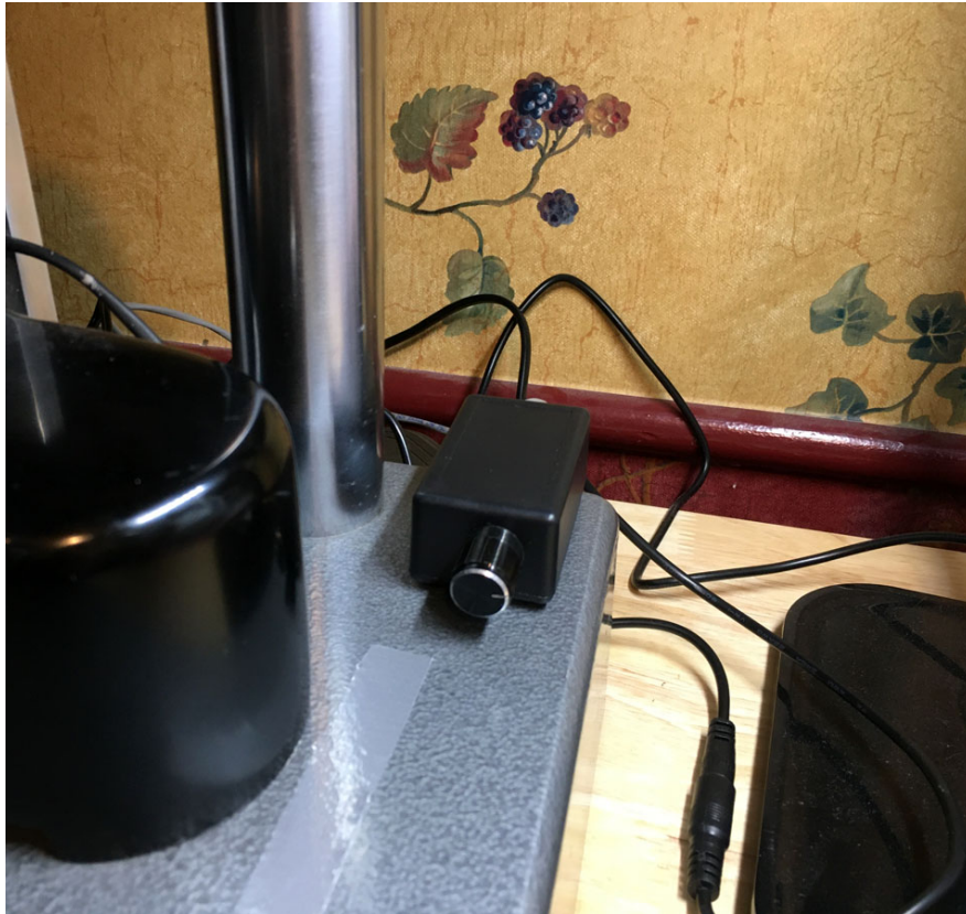
Above: Dimmer 'stuck' to the ARISTOPHOT stand.

At 5500K, I no longer needed a daylight correction filter – it is daylight 4 – and so I put the 80B filter that had covered the light port during the incandescent and halogen illumination days back into its storage case.