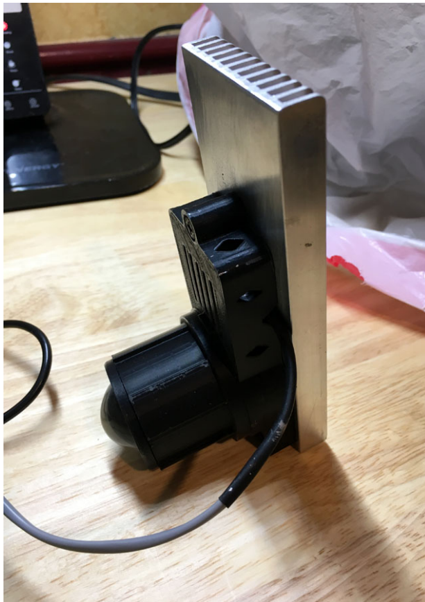
Above: LED illuminator and heat sink before insertion to the Ortholux light tunnel.

Off-the shelf? 10-watt, 800 lumen, 5500K color temperature, LED.