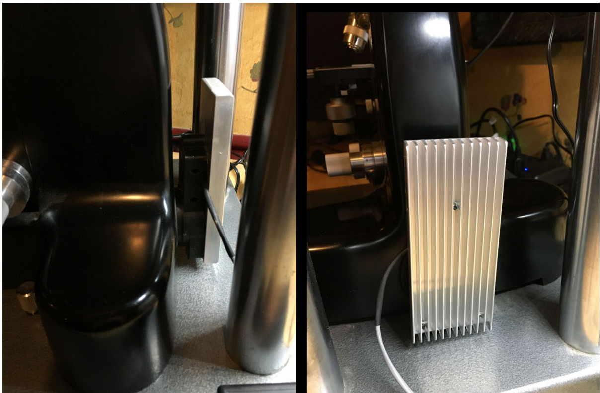
Above: Side and back views of the unit 'in place', on the Ortholux.

In their solution for the Ortholux I, the LED unit replaces the whole lamp assembly so that the collector lenses in front of the old bulb position are gone. It also puts the LED light source forward, and 1.5 inches into the Ortholux's light tunnel. It fits easily, but snugly – the fit is excellent.