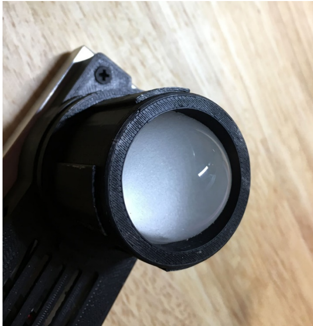
Above: Diffuser and lens.

The LED unit has a diffuser (and lens) as did the original Leitz lamp attachment (not shown in the Leitz manual diagram above).