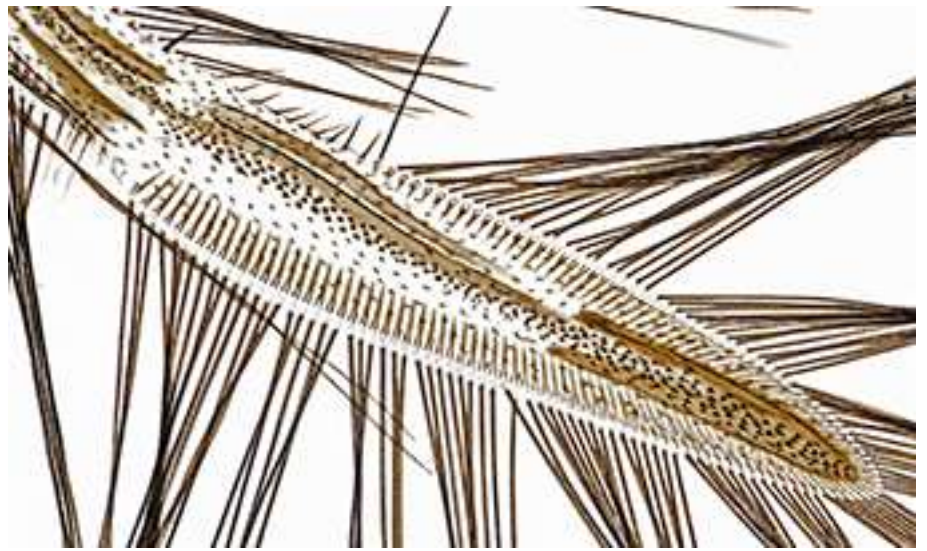
left and above: Olympus 20x Splan Apo; 1.25 intermediate tube + 2,5x projection eyepiece