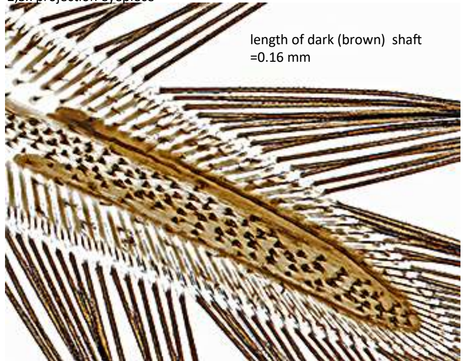
length of dark (brown) shaft = 0.16 mm