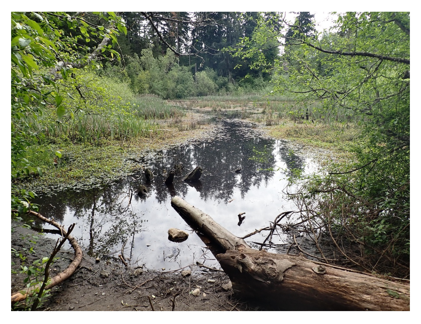
Figure 5. Goodhope Pond, May 12, 2021.