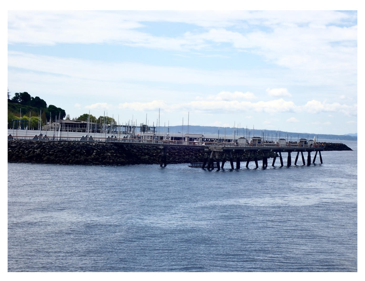
Figure 2. Fishing Pier on May 12, 2021.