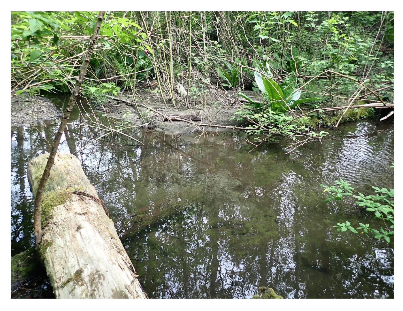
Figure 4. Willow Creek, May 12, 2021.