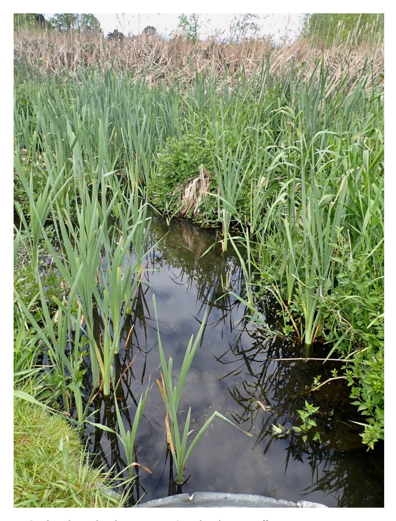
Figure 3. Edmonds Marsh at drain, May 12, 2021.