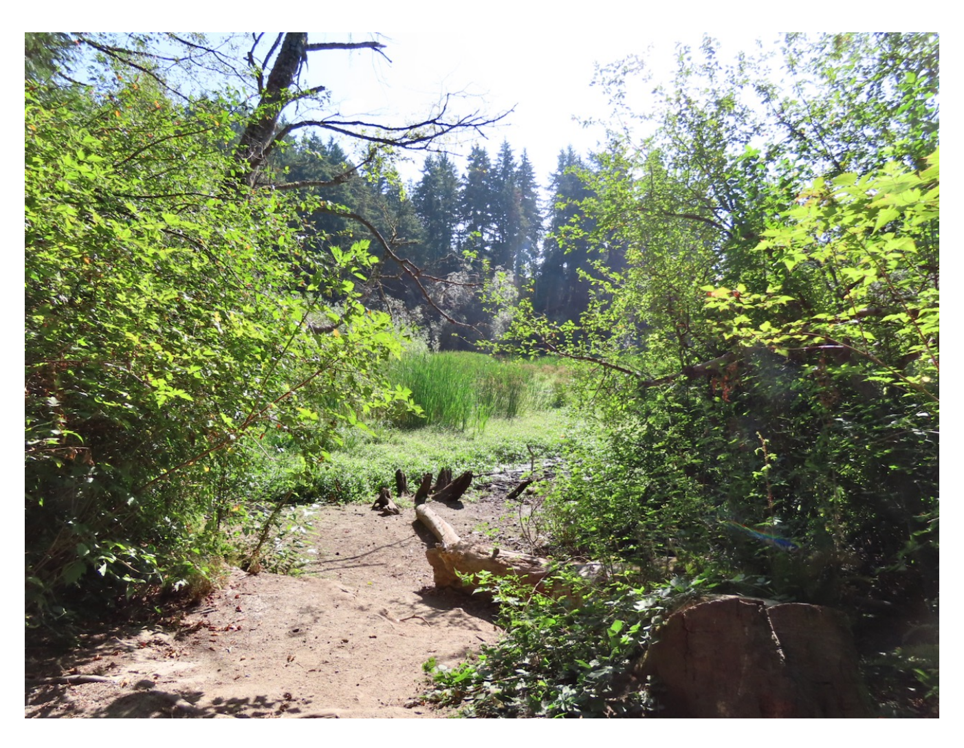
Figure 6. Goodhope Pond, August 19, 2021.