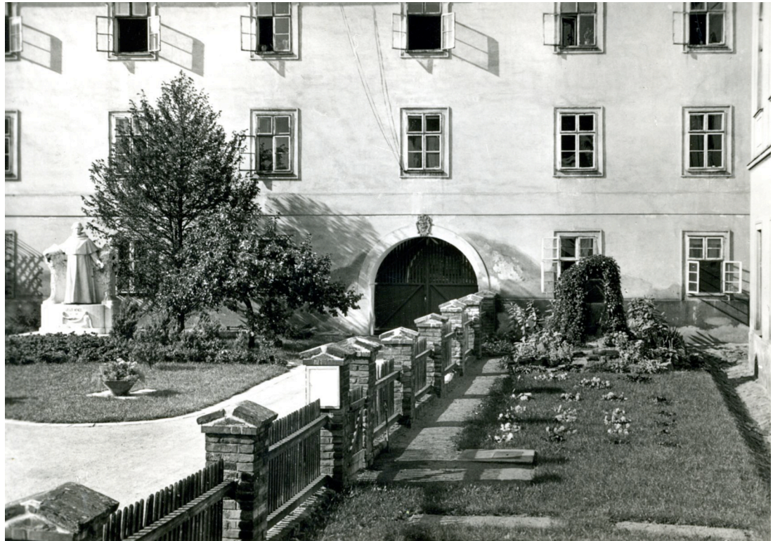
Figure 2. The famous pea garden at the monastery of Brno. Mendel's statue can be seen at the far left, indicating the picture was taken years after Mendel's death and when he was already been recognized as a giant of modern biology.

It would be difficult to write in a clearer style, or been at the same time more concise and more comprehensive. The author brings to life remote, forgotten pieces of information that are however, significant to the better understanding of Mendel's work. Mendel's life is reviewed from his childhood marred by cruel poverty to his refuge into the sheltered (to a point) life of the cloister. The book describes Mendel's incredibly painstaking and methodical experimental work and his touch of genius in using a numerical approach to the collecting and analysis of data. He was not only creating Genetics, he was creating Biostatistics. This in the middle 1860s, at the time of the American Civil War, before DNA (originally called "nuclein") had been discovered by Friedrich Miescher in 1869 (not by Watson and Crick, Wilkins and Franklin in the 1950). This was before Walther Flemming described the process of mitosis in 1882, which is to say long crucially important phenomena such as chromosomal segregation and cross-over could even be suspected to exist.